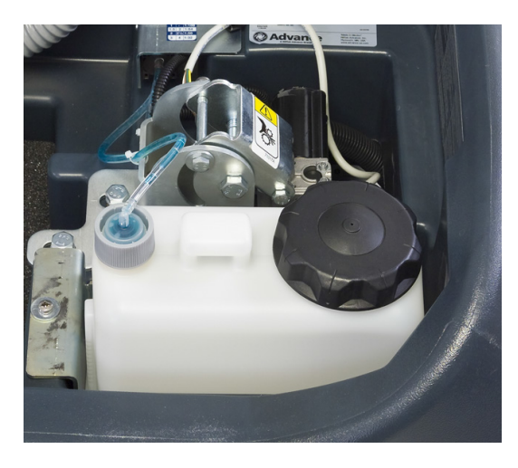
Ecoflex chemical kit (optional); easy to install and immediately accessible