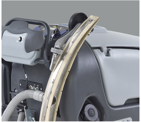
A built-in squeegee hanger makes transport easier through corridors/doorways