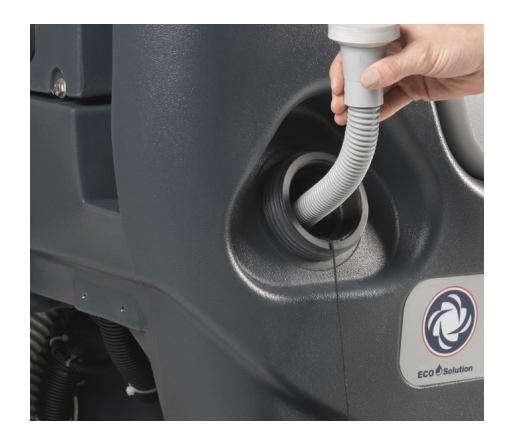
Standard on-board filling hose for simultaneous dump and refill