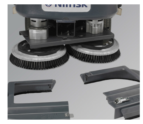
Thanks to the new removable deck covers concept, the scrub deck is immediately accessible