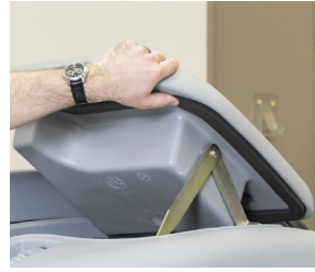
4. Recovery tank seal cover must correctly installed and in good condition