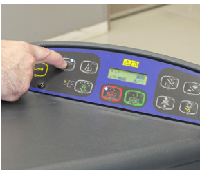
14. Adjust water flow.