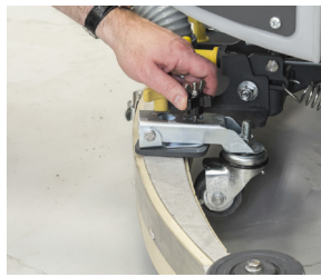
7. Check the height of the squeegee by adjusting the castor wheels and the angle knob.