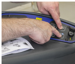
16. In case something does not work enter the Service test mode by pressing the Speed switch and the traction control switch, then on the key. Go through the menu.

If the machine has been used until the Red light illuminates on the battery level indicator on the machine, a full recharge of the batteries (10-12 hours) will be required. Failure to carry out this procedure may cause damage to the batteries. Charging the batteries after every use is recommended.