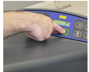
13. Make sure that deck and squeegee are moving down when pressing the button.