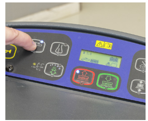
9. Check presence of water in the solution tank.