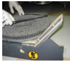
8. Open broom door compartment and check presence of ropes or debris that can block it.