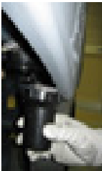
10. If necessary open the solution filter cage and clean the net.