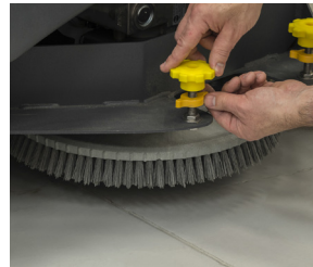
12. Adjust side skirts height