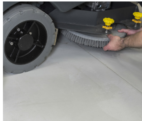
11. Install Brushes.