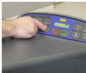
15. Adjust detergent flow.