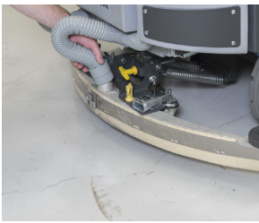
6. Install squeegee