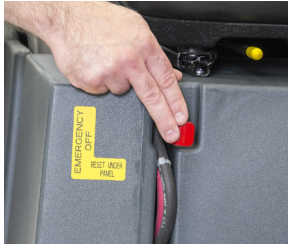
2. Check that the drive pedal is responding and all circuit breakers are armed