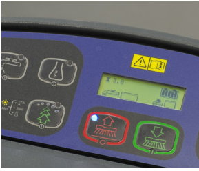
1. Check the battery charge gauge (and if necessary re-charge)

ATTENTION! Do not use the machine before you have read and understood the Instructions for use manual.