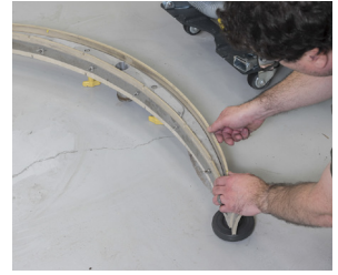
5. Inspect the squeegee blades for cuts or chunks