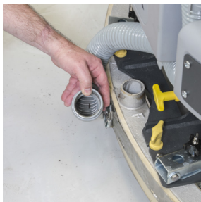
1 Check if the suction hose is correctly installed and cleaned.