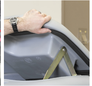
4 Recovery tank seal cover must correctly installed and in good condition.