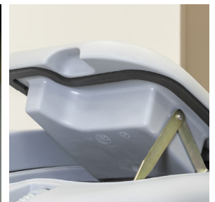
4 Close the recovery tank cover properly and/or verify the gasket wear.