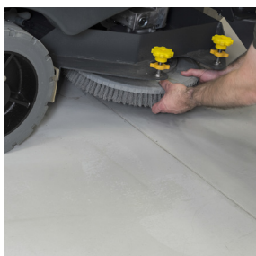
1 Check if the brush are correctly installed and not worn out.