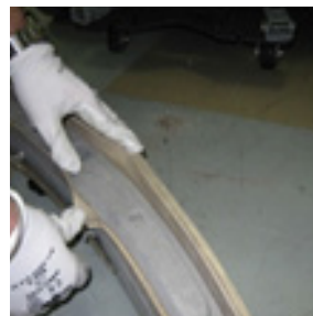
3 Check if squeegee blades are damaged or dirty.