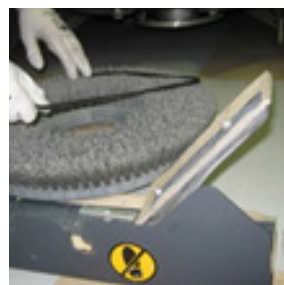
3 Check if there are external materials avoiding brush rotating.