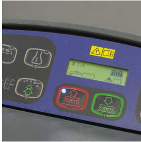
1 Check battery charge gauge.