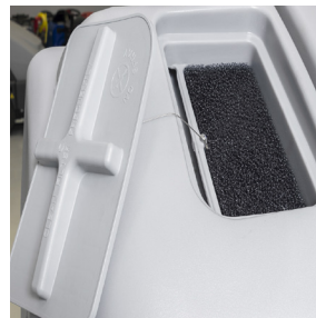
3 Check if the solution filter is cleaned.