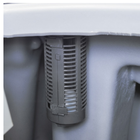
2 Open the recovery tank and check if the vacuum grid and gasket are cleaned.