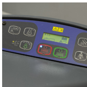
2 Check if there isn't any brush motor overload i.e. 3 battery Ledsflash simultaneously.