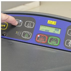
1 Check if you have the right water settings.