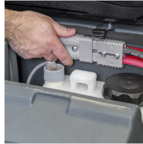
3 Check battery cables are well connected together.