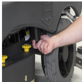
2 Check if the solution tap is open.