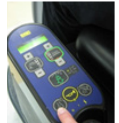
15. Adjust detergent flow.