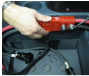
3. Check battery cables are well connected together.