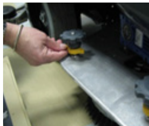
12. Adjust side skirts height