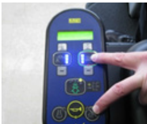
16. In case something does not work enter the Service test mode by pressing the scrub ON switch and the Vacuum switch together and turn on the key. Go through the menu.

If the machine has been used until the Red light illuminates on the battery level indicator on the machine, a full recharge of the batteries (10-12 hours) will be required. Failure to carry out this this procedure may cause damage to the batteries. Charging the batteries after every use is recommended.