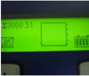
1. Check battery charge gauge.

ATTENTION! Do not use the machine before you have read and understood the Instructions for use manual.