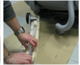
5. Inspect the squeegee blades for cuts or chunks.