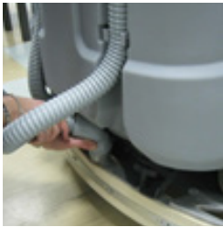
6. Install squeegee.