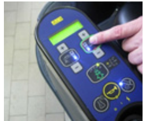
13. Make sure that deck and squeegee are moving down when pressing the button.