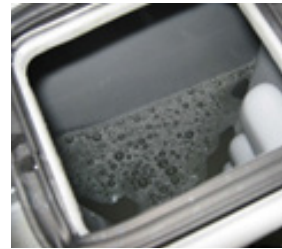
9. Check presence of water in the solution tank.