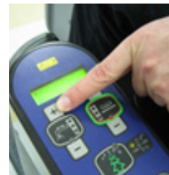
14. Adjust water flow.