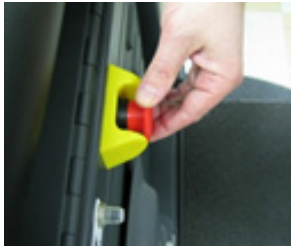
2. Check that the drive pedal is responding and all circuit breakers are armed.