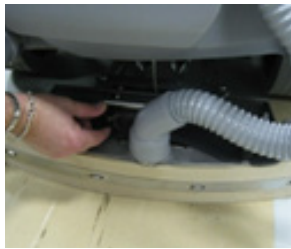
7. Check the height of the squeegee by adjusting the castor wheels.