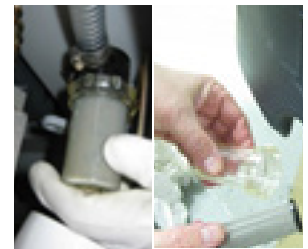
10. If necessary open the solution filter cage and clean the net.