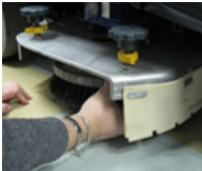
11. Install Brushes.