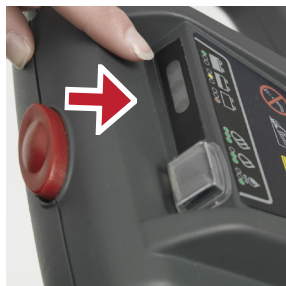
2 Check if there isn't any brush motor overload i.e. 3 battery Ledflash simultaneously.