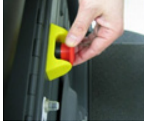
2 Check that the drive pedal is responding and all circuit breakers are armed.