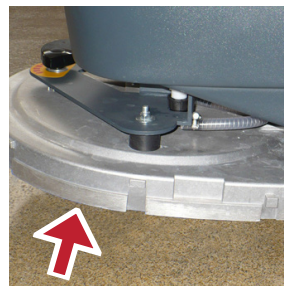
3 Check if there are external materials avoiding brush rotating.