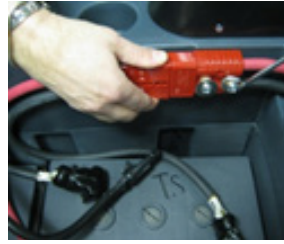
3 Check battery cables are well connected together.