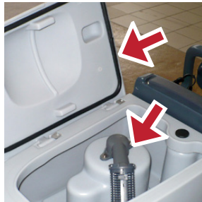
2 Open the recovery tank and check if the vacuum grid and gasket are cleaned.