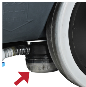
3 Check if the solution filter is cleaned.