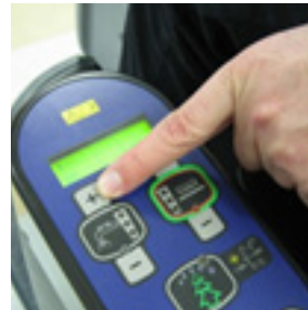
1 Check if you have the right water settings.