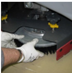
1 Check if the brush are correctly installed and not worn out.