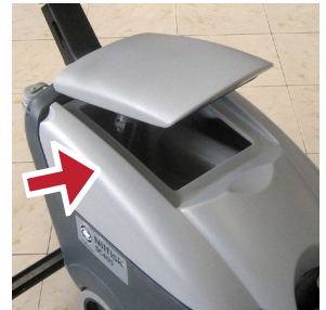
4 Close the recovery tank cover properly and/or verify the gasket wear.