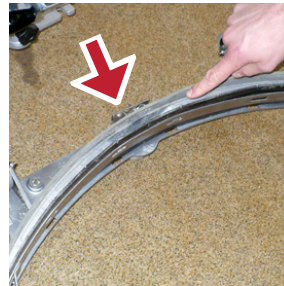
3 Check if squeegee blades are damaged or dirty.