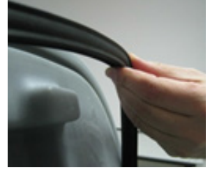
4 Recovery tank seal cover must correctly installed and in good condition.