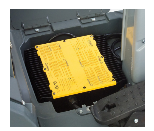
An integrated on-board charger enables easy plug-in and battery charge at any outlet