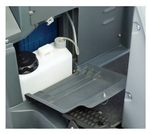
Easy change of cartridge, now located underneath the seat