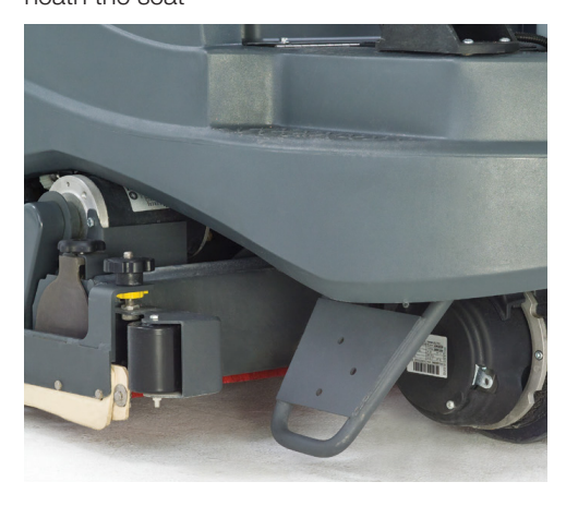
Both the cleaning deck and the squeegee sides are well protected by large roller bumpers