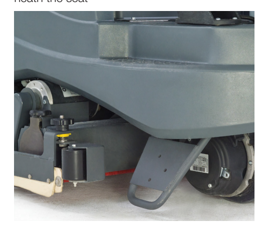
Both the cleaning deck and the squeegee sides are well protected by large roller bumpers