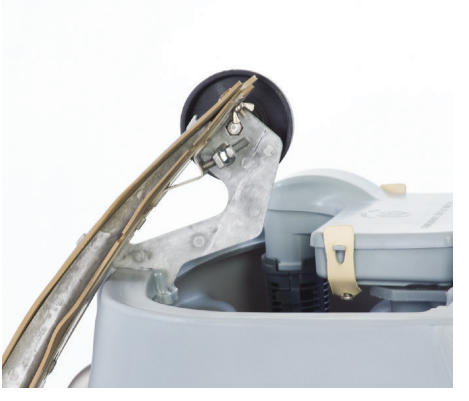
Built-in squeegee hanging system on recovery tank for easy machine transfer in narrow areas