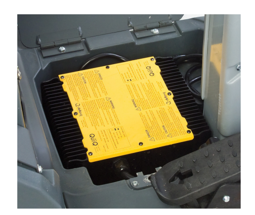
An integrated on-board charger enables easy plug-in and battery charge at any outlet