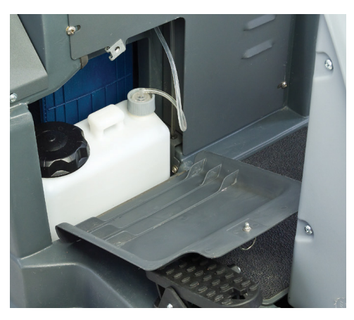
Easy change of cartridge, now located underneath the seat