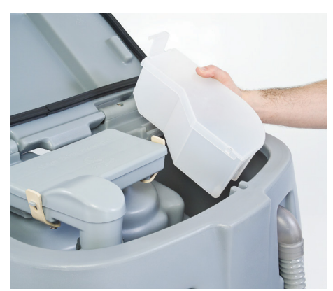
A debris tray captures the dirt from the suction hose to prevent it from entering the recovery